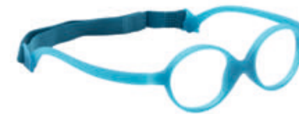
1304060 / 1304065 Turquoise col. B03