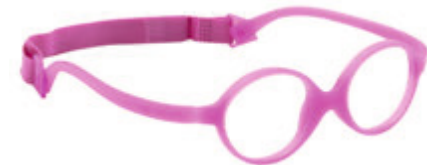
1304062 / 1304067 Fuchsia col. B09