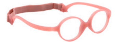
1304061 / 1304066 Rose col. B05