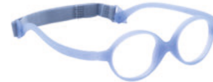
1304059 / 1304064 Denim light blue col. B02