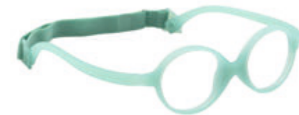
1304063 / 1304068 Light grey green col. B12